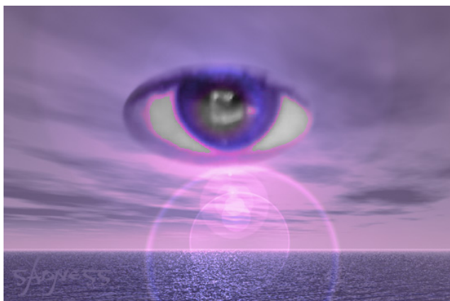
"Sadness" created by Revenant aka Slaygen

I've used this exercise to escape my body a few times. It can also induce other weird but harmless effects. Close your eyes and spend a few minutes relaxing as completely as you can and clearing your mind of all worries and idle thoughts. Then, spend a few minutes trying to decide where your consciousness is seated. Is your consciousness in the center of your head or perhaps somewhere between the eyes? Wherever it is, visualize a tiny pinpoint of light at that point. You don't have to be exact about the location. If you're not comfortable with where you have visualized the pinpoint of light, move it until you are comfortable with it. Spend a few minutes visualizing that pinpoint of light as clearly as you can. Try to shrink your awareness until you are only aware of your head. Then shrink your awareness even further, so that you can't feel anything except that pinpoint of light. Next, visualize the point of light slowly moving down toward the base of the brain, where the cerebellum is. Move it about four inches down, then slowly move it back to its original position. Repeat this visualization several times. This visualization can induce the vibrations and get you out of your body.