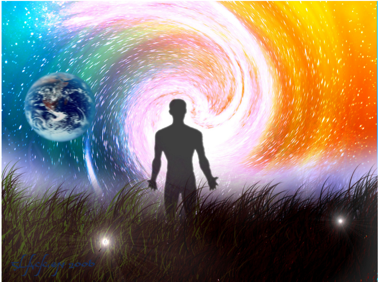
"Life" created by Revenant aka Slaygen