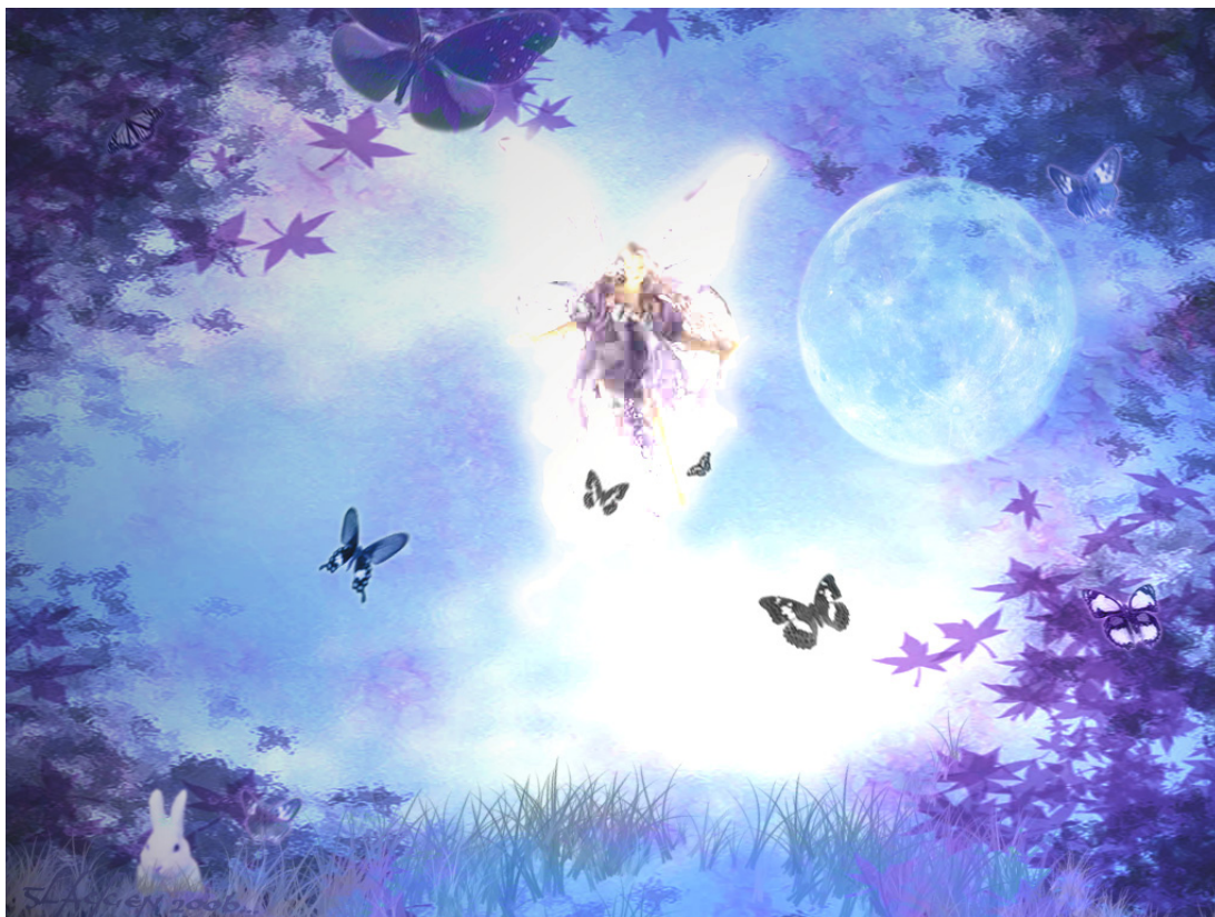
"Butterflies" created by Revenant aka Slaygen